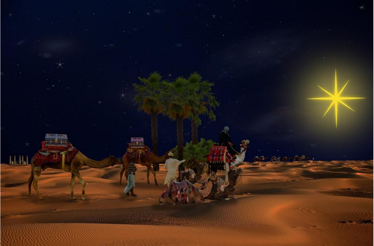
"Holy Three Kings Caravan"

"He came as a witness to testify to the light, so that all might believe through him."