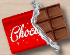
CANDY BAR WRAPPERS