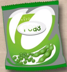
FROZEN FOOD BAGS