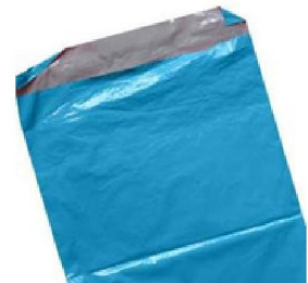
plastic shipping envelopes (labels removed)