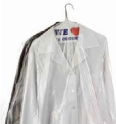
dry cleaning bags