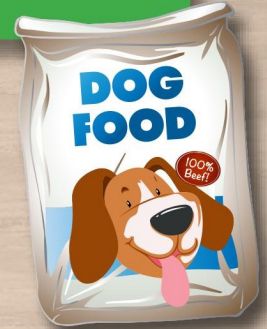
PET FOOD BAGS