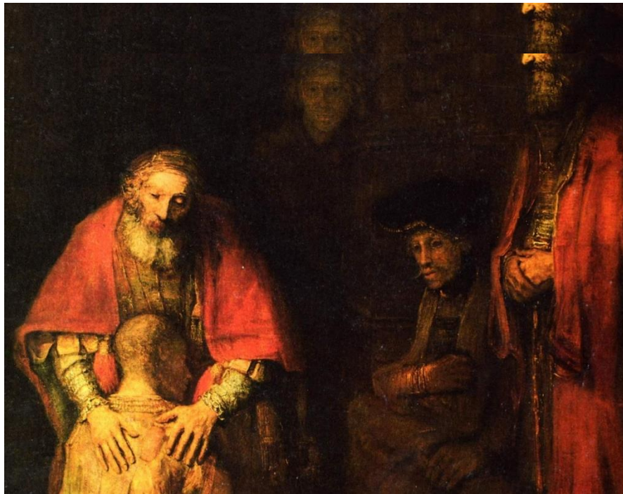
"Return of the Prodigal Son" Rembrandt

For this son of mine was dead and is alive again; he was lost and is found!