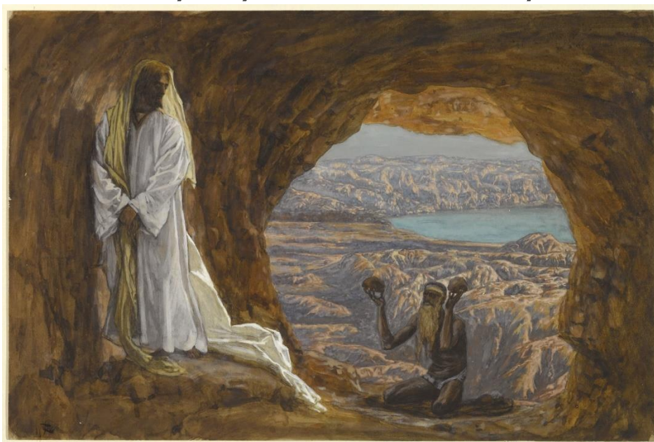
“Jesus Tempted in the Wilderness” by James Tissot

Jesus, full of the Holy Spirit, returned from the Jordan and was led by the Spirit in the wilderness, where for forty days he was tested by the devil..